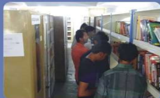
Open Shelf System