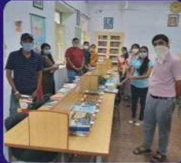
Book-Bank Facility for needy students